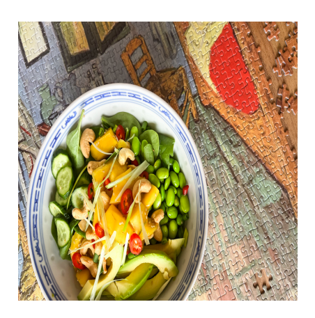
Poke loke mango bowl